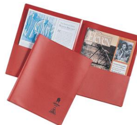
3 Plastic folders with brads (red, yellow and blue)