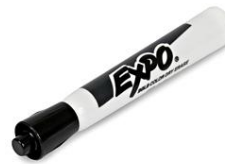
1 pack dry erase markers