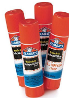
1 pack glue sticks 1 glue bottle