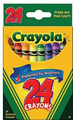
1 pack of crayons or colored pencils