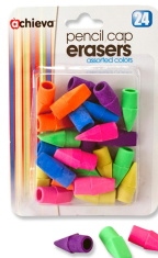
1 small pack cap erasers