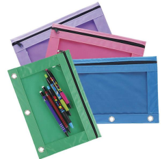
1 pencil pouch