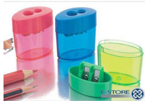
1 small pencil sharpener