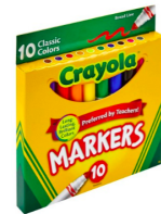
1 pack markers